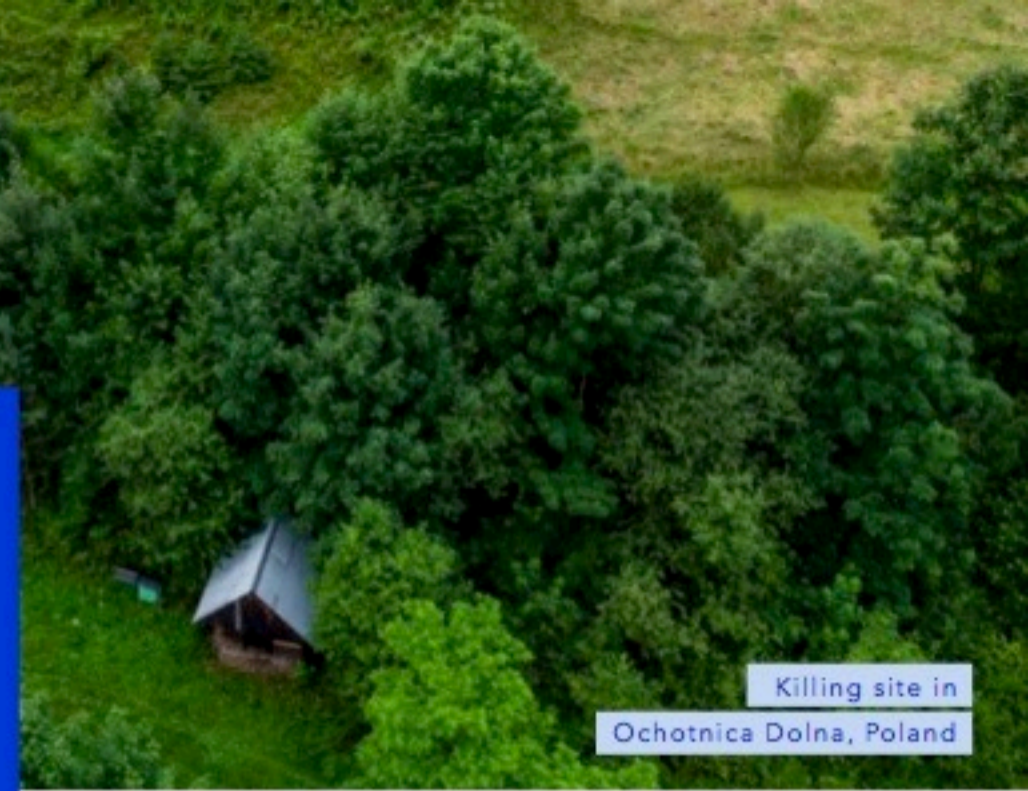
Killing site in Ochoznica Dolna, Poland