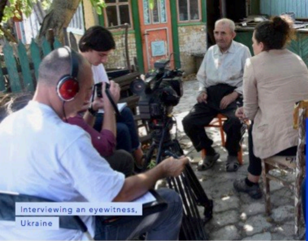
Interviewing an eyewitness, Ukraine