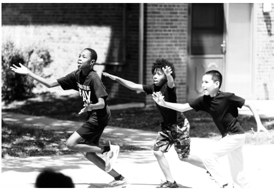
“ Afternoon games bring teamwork and laughter for youth