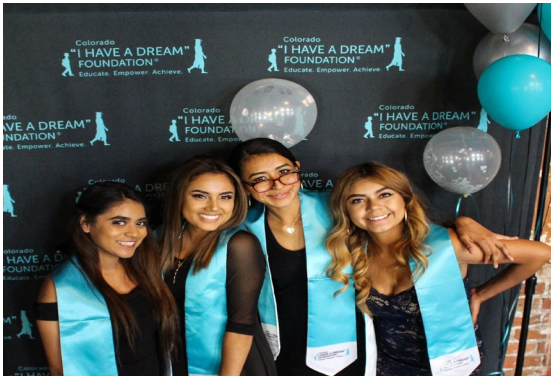
"Dreams realized: Celebrating the journey and achievements of our incredible graduates."