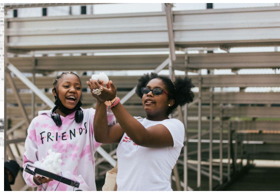
"Future scientists at work: Experimenting