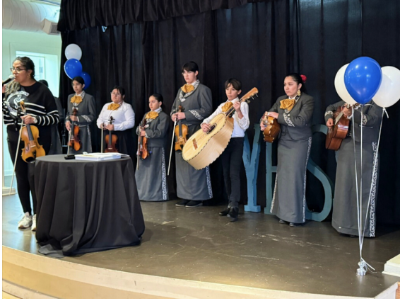
(Performance at Community Event)

participation and trust, strengthen community connection, and increase positive behavioral outcomes. They are grateful to OSS YVP for ensuring they had the necessary resources to make long-term, meaningful impacts on their YESS Families, and to connect youth to their culture and interests.