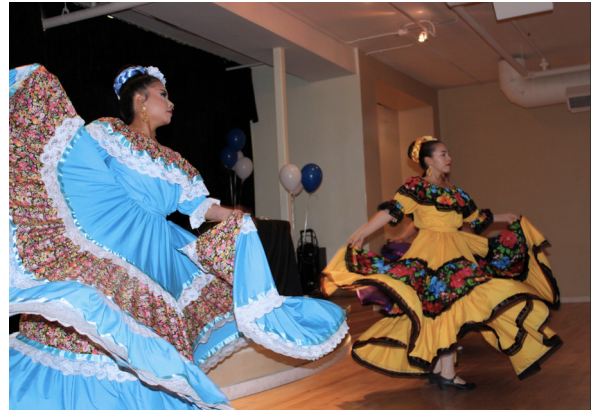
(Performance at Community Event)