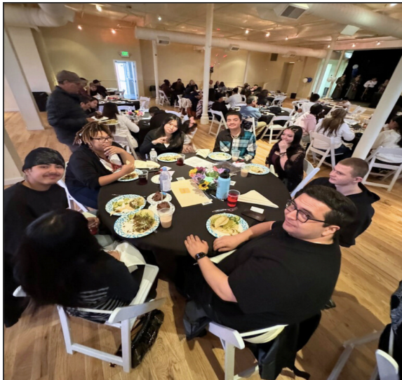
(Hosted Community building event)