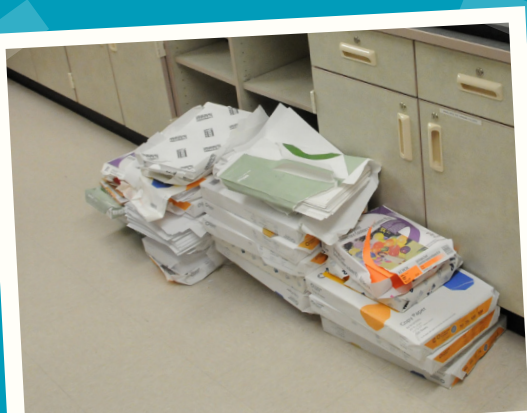
Reduce clutter and organize closets, cabinets, and storage facilities to eliminate shelter for unwanted pests.