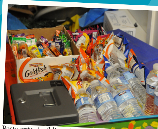
Pests enter buildings in search of food and water. Make sure to store edible materials in airtight plastic containers.