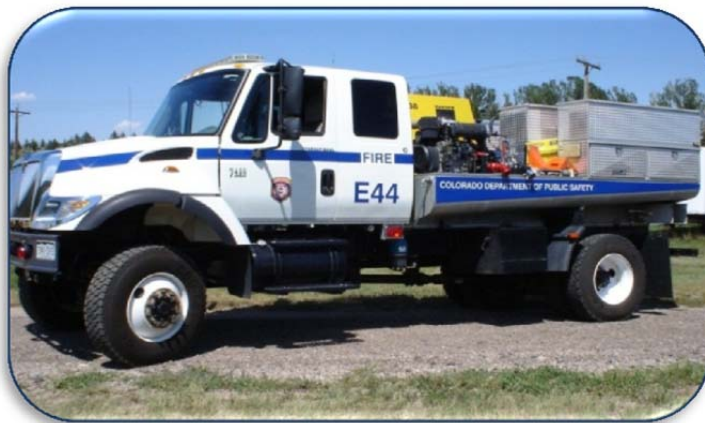
Example of DFPC Type 4 Engine

The 2013 plan for state engines will be based on wildfire risk and need as well as available funding, and may include any number of potential arrangements, including: