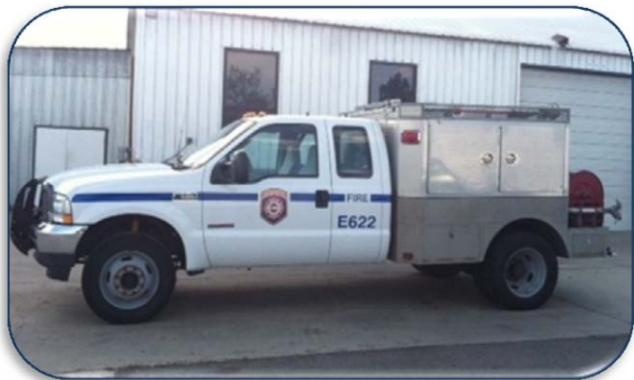
Example of DFPC Type 6 Engine