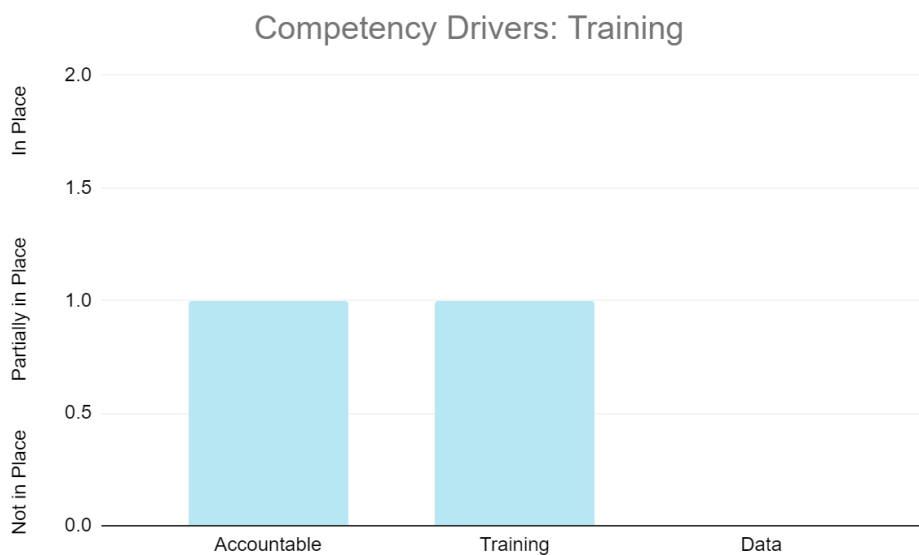
Figure 3: DBPA results for Training Driver for November, 2019

In order to increase their internal capacity to meet training needs, ComCor has set a goal to improve its score in the three areas that comprise the Training driver. The current scores for these drivers are shown in Figure 3 below.