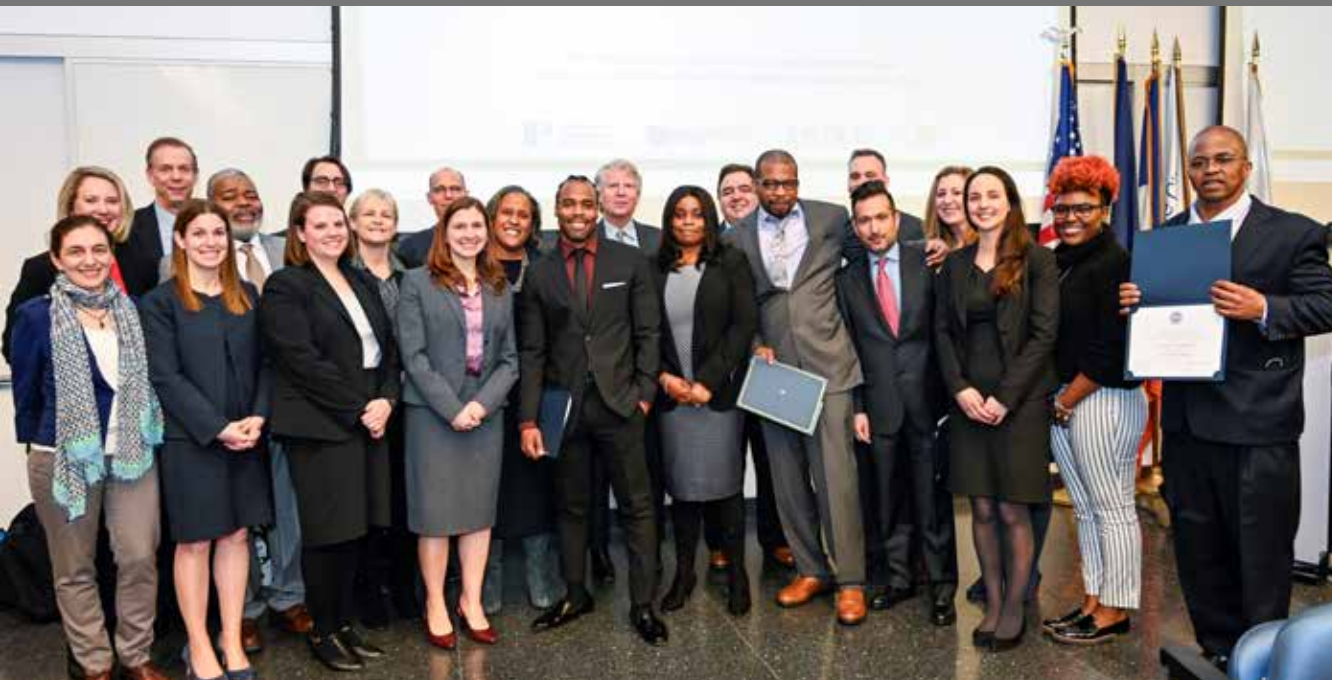
Third ICJ graduation at John Jay College of Criminal Justice. March 2019.

Inside Criminal Justice, a joint initiative of The Manhattan D.A. Academy, the Institute for Innovation in Prosecution at John Jay College of Criminal Justice, and the Center for Justice at Columbia University, is a semester-long seminar comprised of individuals incarcerated at Queensboro Correctional Facility and prosecutors from the Manhattan District Attorney's Office.