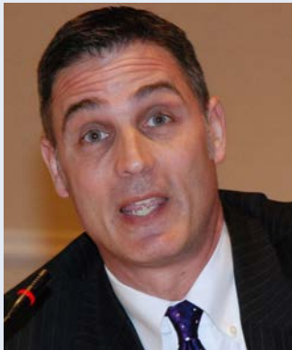
Drug Enforcement Agency

The campaign to disseminate information about opioids and connect people to treatment and other services was a critical component of the Minnesota Model. The organizers hosted town halls and public forums with health care and mental health professionals, treatment providers, law enforcement representatives, prosecutors, people in recovery, and family members of victims whose lives were lost to addiction. Organizers distributed information about drug treatment and naloxone, and guest speakers shared their own experiences.