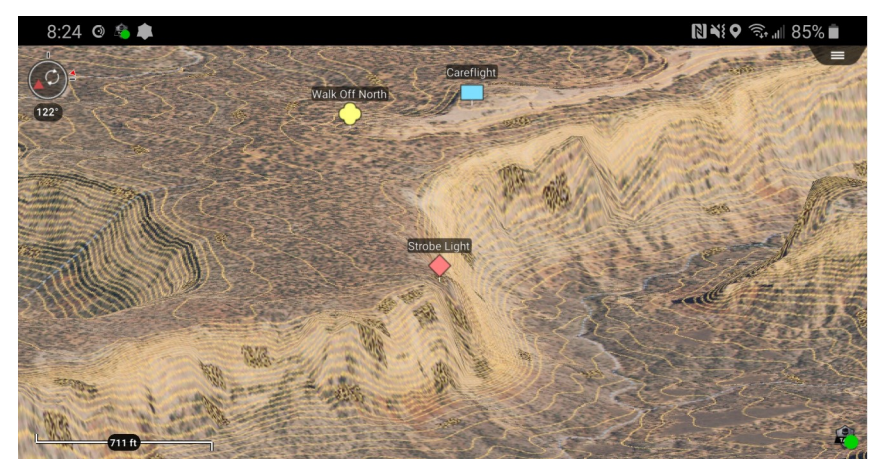
Figure 12— Rugged Terrain of Second Mission Viewed in 3D Using TAK

At about 2315 hours, medics on the helicopter reached the patient and indicated that they were attempting to stabilize him for transport but would be waiting for SAR to do so. OPS sent an