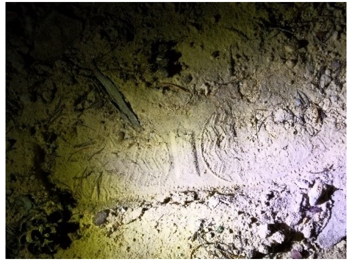
Figure 9— Subject's Footprint