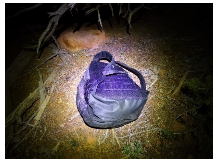
Figure 8— Backpack Belonging to Subject

Team 2 created and broadcast a point in TAK indicating the location of the backpack. Teams continued south utilizing a search dog to speed tracking efforts. Teams 4 and 5 located the uninjured subjects at about 0300 hours. They were transported back to mission base by ATV and vehicles. Using Team 4 and Team 5's locations, Team 2 created a waypoint and designated it as the find location in TAK.