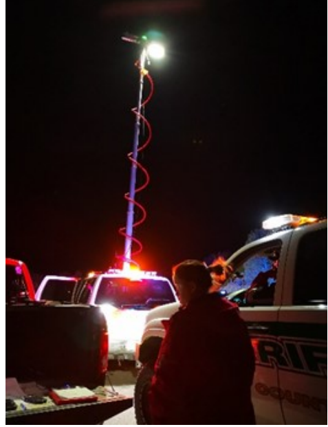
Figure 7— Scene at Command Post During Mission

Team 2 on the south side of the road located footprints at the entry to the tunnel and about 30 feet after the tunnel ended. The terrain turned