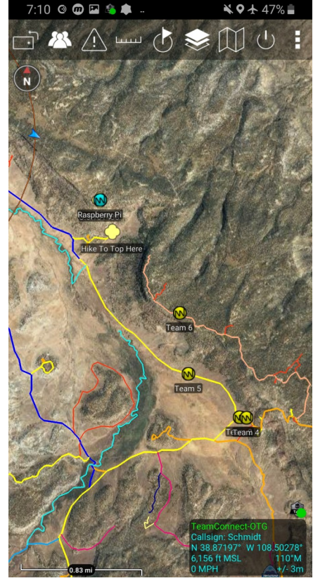
Figure 3— Search Teams and Trail Data Displayed in TAK

Six search teams were outfitted with the TAK/goTenna Pro package. Field teams received no training on using