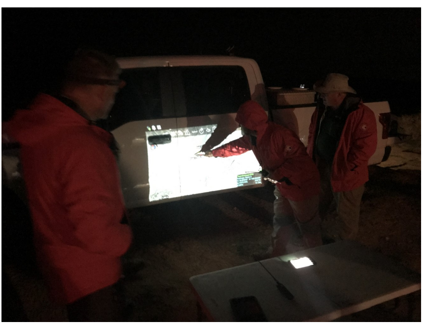
Figure 5— TAK Projected onto Side of Pickup Truck

It may be useful to create a local network in the physical area of the Operations base so that many users are able to view TAK information. In this case (due to minimal cell connectivity), each device user who wanted to view data needed an attached