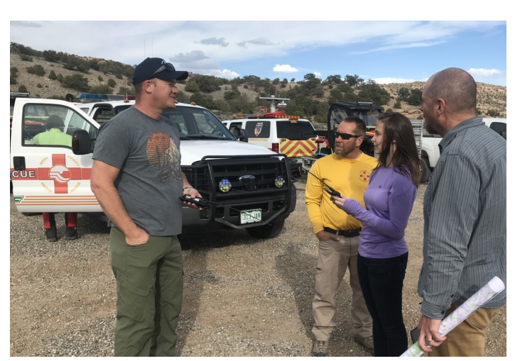
Figure 2— Providing goTenna Pros to Field Teams

The training mission was for prospective search and rescue members. It was a field exercise, serving as the culmination of several months of training and was formatted as a long-distance tracking exercise (approximately 10 miles) finishing with a low-angle rope element and litter-carry of an (simulated) injured party. It was the final test in which prospective members are chaperoned and evaluated by team members throughout the evolution. Two groups totaling five individuals, who were role-playing "victims" were given assignments on generally where to hike and where to simulate their injury. Although this was a training mission, participants did not know