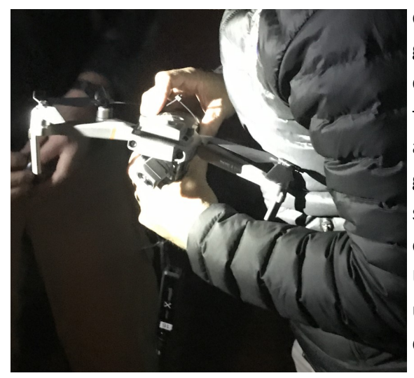
Figure 4— Affixing a goTenna Pro to a UAS

The goTenna Pros communicated across an area of approximately 10 square miles. Although the maximum effective distances were not tested, it was discovered that ridge and canyon features limited connectivity as would be expected based on known UHF radio propagation characteristics. One particular search team lost contact via the TAK/goTenna Pro package early in the exercise, though they were still in contact with